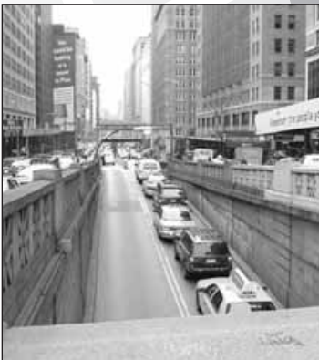
A tunnel will require unsightly multiblock-long entrance ramps on each end.