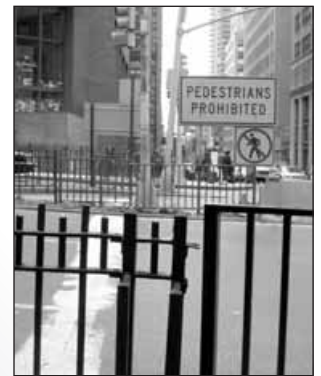
Tunnel entrances are not pedestrian-friendly. This midtown tunnel entrance was the most dangerous intersection in Manhattan in 2001.